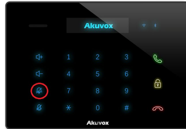
Figure 2.4 DND