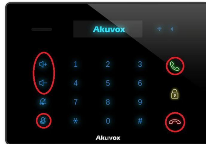
Figure 2.2 Receive a Call