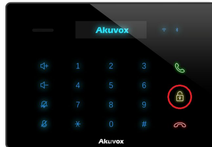
Figure 2.2 Receive a Call