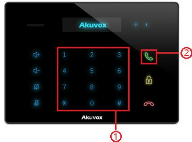
Figure 2.1 Making a Call