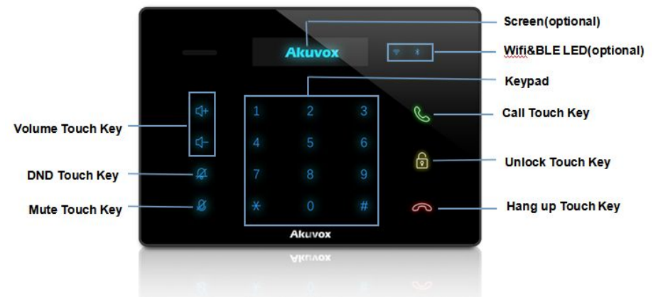
Figure 1.1 Product Description

C312X are often applied to scenarios such as villas, apartments and buildings.